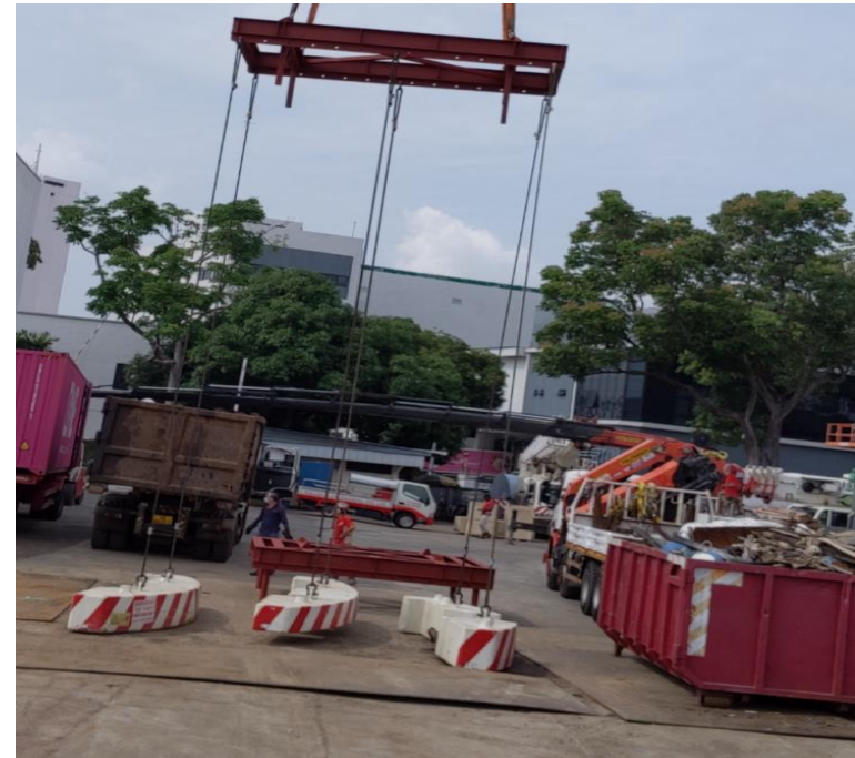
TIONG AIK CONSTRUCTION PTE LTD