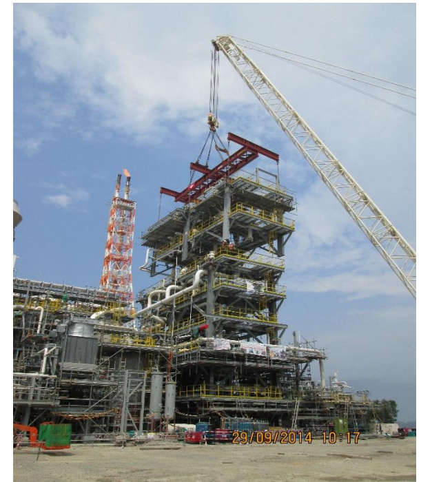
HYUP SOON INDUSTRIES SDN BHD